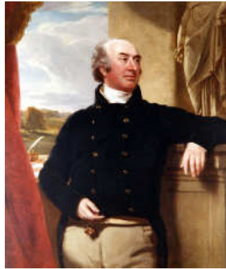
Thomas William Coke, 1 st Earl of Leicester (Coke of Norfolk)