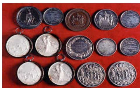
Part of the collection of medals and badges