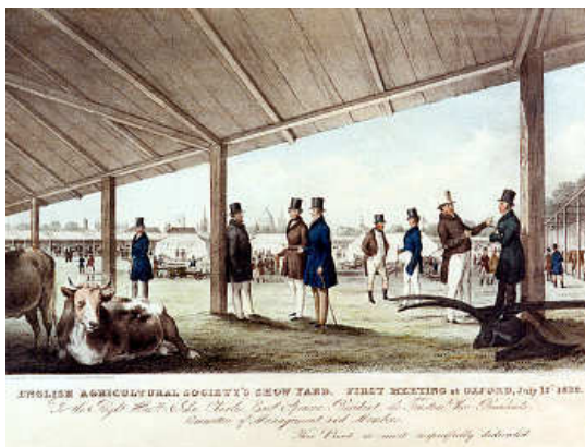
Royal Show Oxford 1839

The collection includes charters, seals, ceramics, silverware and many other items of interest.