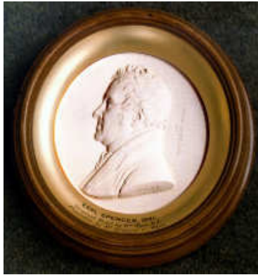
Ceramic of 3 rd . Earl Spencer, the Society's first President