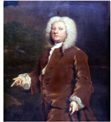
Jethro Tull, inventor of the seed drill

The Artefacts are in many ways complimentary to the Library in that they reflect not just the development of the Society itself but in a wider context that of the agricultural industry.